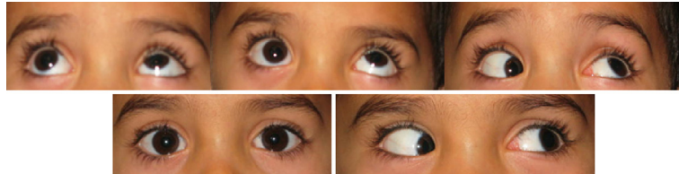
Fig. 1 – Right eye Brown syndrome.

A child, aged 4, brought to the practice by his parents who detected that he deviated his gaze since birth. Motor examination revealed orthophoria in primary position, downshoot in levoversion and difficulty for elevating in all positions, markedly in the field of action of the right lower oblique muscle (Fig. 1). Visual acuity of 20/20 in each eye with sphere of