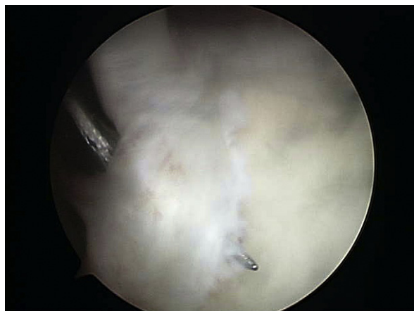
Fig. 1. A No. 2 nonabsorbable suture with a penetrating suture retriever is grasped and then passed via the anterior-superior portal through the labral tissue residing posteriorly to the biceps tendon.

Multiple working and viewing portals are conventionally employed for arthroscopic repair of the superior labrum. In 1998, Mileski and Snyder 3 described use of the standard posterior, anterosuperior, and midglenoid portals for arthroscopic repair of SLAP lesions. However, other orthopedic specialists have utilized the standard posterior, anterior, anterosuperior, and anteroinferior portals for this purpose. 6,8 O'Brien et al 7 introduced the transrotator cuff approach for SLAP lesions located posterior to the biceps