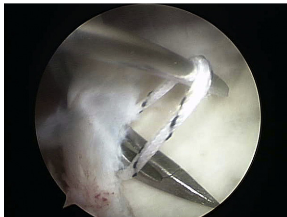
Fig. 2. The spinal needle is passed under the strand and releasing penetrator. Suspension of the FiberWire by the spinal needle is termed “needle-catch”.

A No. 2 nonabsorbable suture (FiberWire; Arthrex, Naples, FL, USA) with a penetrating suture retriever (Penetrator; Arthrex, Naples, FL, USA) is grasped and then passed via the anterior-superior portal through the labral tissue residing posteriorly to the biceps tendon (Fig. 1). One spinal needle is inserted through the skin and directed toward the FiberWire; the needle is then passed under the strand and releasing penetrator. Suspension of the FiberWire by the spinal needle is illustrated in Fig. 2 and is referred to as “needle-catch”. The penetrator is passed through the labral tissue anterior to the biceps tendon, and the FiberWire is grasped and retrieved from the anterior-superior portal (Fig. 3). A grasper, which is inserted through the anterior-superior portal, is used to retrieve the suture limb posterior to the biceps tendon such that the suture can be flipped from above the biceps to an inferior position (Fig. 4). The spear is passed through the anterior-superior portal and placed on the glenoid rim. A bone socket for positioning of the anchor is then created by drilling. Two strands of FiberWire are threaded through the distal eyelet of a bioabsorbable knotless anchor (PushLock; Arthrex, Naples, FL, USA). Tension is applied and the anchor is