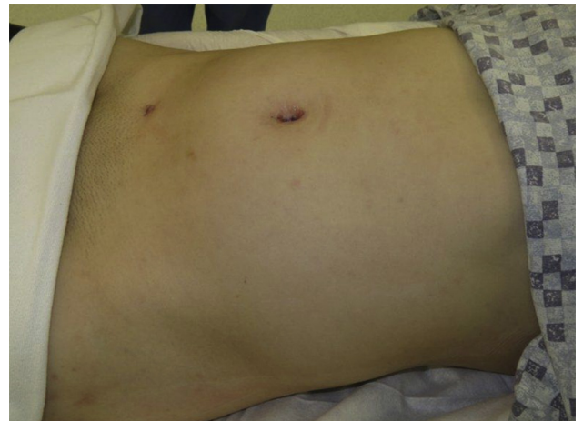
Fig. 2. Post-operative incision at the umbilicus and 2 mm skin nick in the right lower quadrant, both dressed with skin glue.

In the supine position with both arms tucked and a urinary catheter in place, the abdomen was accessed via the umbilicus. A vertical incision was made through the skin within the confines of the umbilicus. A hemostat was utilized to bluntly clear subcutaneous fat from the linea alba inferiorly and superiorly. The linea alba was then sharply incised, allowing for hemostat passage through the peritoneum. With the tip of the hemostat directed upward, the abdominal wall was elevated and the linea alba further opened over a length of 2 cm. Through this umbilical opening, the