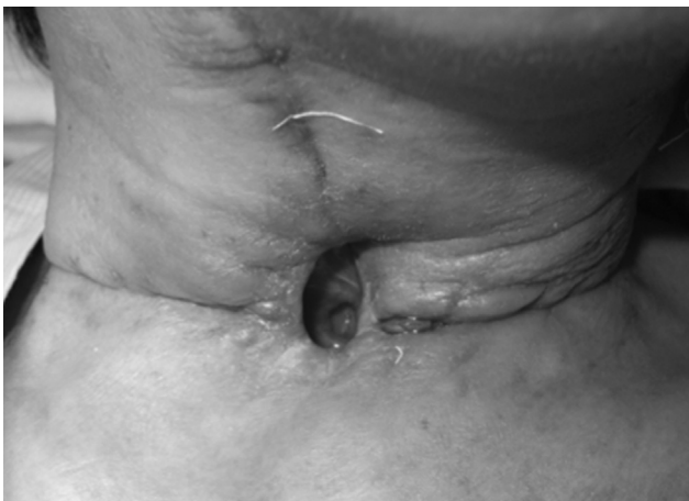
Figure 1 Tracheoesophageal fistula on the posterior wall of the trachea was observed through the tracheocutaneous fistula.

Videofluorography performed on the 36th day after the surgery did not demonstrate either leakage from the esophagus or laryngeal penetration, restoring the patient's ability to ingest a normal oral diet. Furthermore, the suitable volume of the DP flap allowed the TCF to become slender like a slit, which allowed excellent and fluent speech to develop without covering the TCF with her finger (Fig. 4). Moreover, the patient reported that there was no severe inconvenience during speech or food intake. Finally, closure of the TCF was then completed.