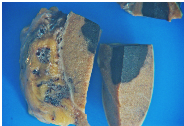
Fig. 1. Macroscopic view of the testicular specimen. Melanoma appears in dark blue.

A per os chemotherapy containing temozolomide was administered, only 3 doses in 5 days because of the poor tolerance with increased confusion.