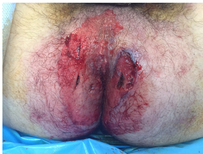
Fig. 3. Intraoperative photograph after superficial debridement and tissue biopsy.

Over the following three days, the patient was observed in the hospital wards while on intravenous antibiotics. While his perianal clinical exam did not change, the patient began to experience febrile episodes as high at 104°F (40°C) and his leukocytosis persisted. By the fourth hospital day, on clinical exam the patient had developed significant bilateral perianal ecchymoses and perianal edema with increased tenderness to palpation (Fig. 2A). CT of the pelvis was repeated and only remarkable for increased circumferential perianal inflammation and edema without any appreciable