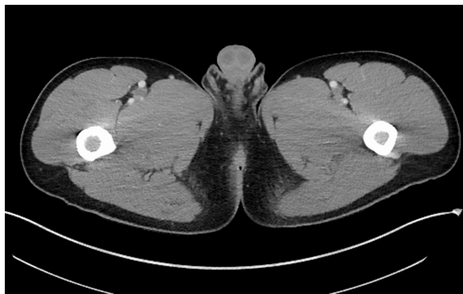
Fig. 1. Initial computed tomography of the pelvis revealing mild inflammation of the perianal skin and tissue surrounding the rectum.

growths in the anal canal. The patient underwent an uneventful ambulatory examination under anesthesia with excision and fulguration of the anal canal lesions. Final surgical pathology reported condyloma acuminatum.