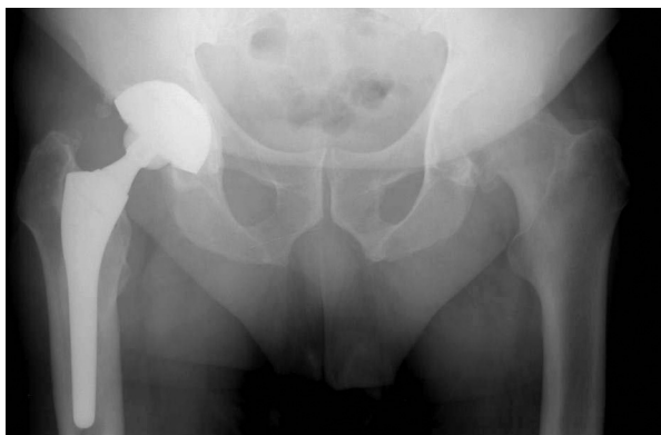
Fig. 1. Left hip pre-operative X-ray and primary implant of the ceramic–ceramic total hip arthroplasty on the right hip after 11 years follow-up.

Therefore, in November 2010, 25 months after the initial procedure, the patient underwent prosthetic surgical revision. Intraoperatively, grayish caseous material was evident, once the greater trochanter was exposed. Creamy lead gray material spurted out from the hip articulation, occupying most part of trochanteric area (Fig. 3A). The stem appeared well fixed and stable. The remaining lytic area was filled with 11 cc of demineralized bone matrix (DBX by Synthes) and closed with the residual thin trochanteric wall (Fig. 3B). Histological sample examination confirmed metallosis, revealing amorphous fibrous material with marginal necrotic areas and inflammatory lymphocytic infiltrate, coupled with necrotic bone spicules and hemosiderin macrophages. Microbiological samples revealed no infection.