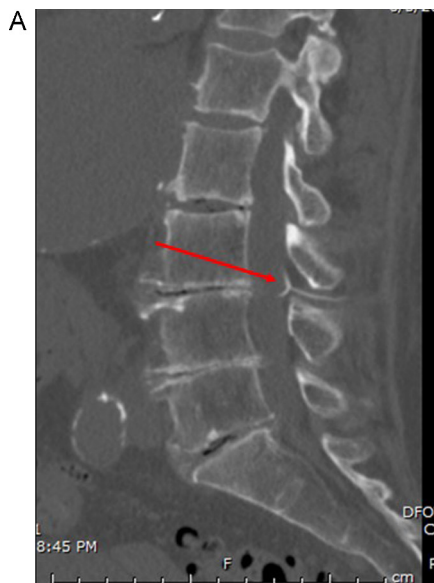
Fig. 2. Sagittal view of lumbar spine.

Patient was discharged to rehab on 4 days after catheter removed with slight anterior thigh pain and without significant recovery of her right thigh strength. The patient's thigh strength was noted to be normal by 3 months after index surgery with no CSF complications. Patient recovered full motor, sensory as well as