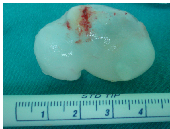
Fig. 3. T2-weighted sagittal MRI shows that the hydatid cyst was completely removed (white arrows).

Follow-up examination 5 months post surgery showed that the patient’s paraparesis resolved almost completely and postoperative MRI showed that the hydatid cyst had been completely removed (Fig. 3). The patient was completely recovered 6 months post surgery.