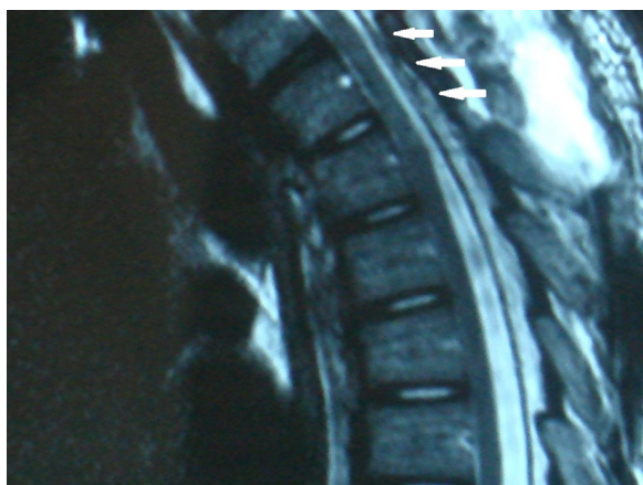
Fig. 2. The hydatid cyst was dissected from the spinal dura, nerve root, surrounding bone, and paraspinal space, and completely removed.

peroxide. Histopathological examination confirmed the diagnosis of hydatid cyst.