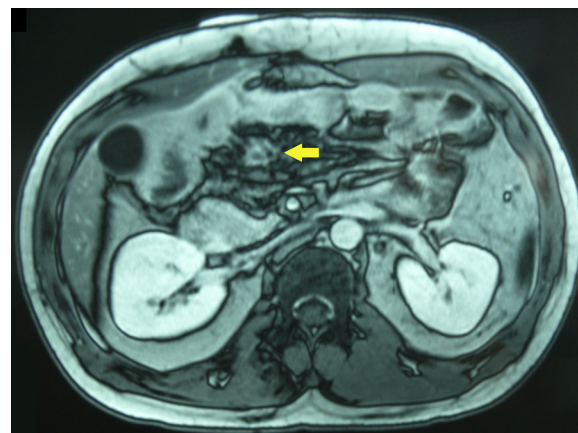
Fig. 2. Magnetic resonance imaging performed after CT-guided percutaneous drainage. The abdominal mass had a smaller diameter (2.5 cm).