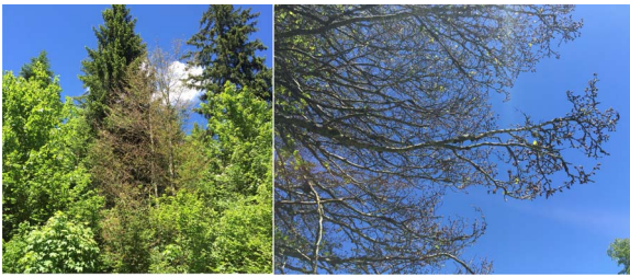
Fig. 1. Frost damage observed on European beech on June 22, 2016 induced by a late spring frost event on April 28, 2016 in the Swiss Jura Mountains at 1100 m a.s.l. (© photo: left M.R., right Y.V. June 22, 2016).