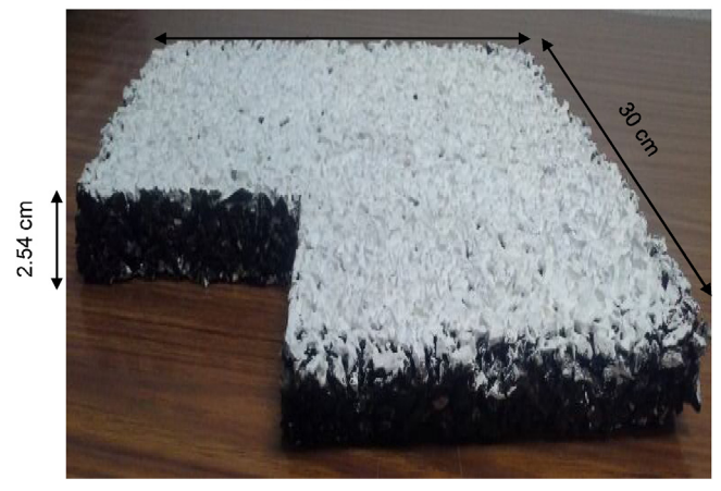
Fig. 1. Non-scaled Scrap tire block (STB) of 1 inch thickness painted white on the outer-facing surface.

their previous results and considering the properties of STs, these authors showed evidence that STs may be used as insulation material on external building elements, resulting in energy savings and a more stable temperature inside residential buildings. In addition, STs have presented certain positive characteristics such as resistance to mold, mildew, heat, humidity, ultraviolet rays (from the sun), acids and other chemicals. Moreover, STs show retardation of bacterial development [9], making them attractive for several applications.