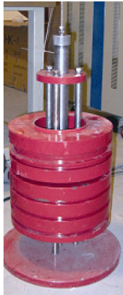
Fig. 2. Gravity storage device.

gravity loading can effectively avoid the influence on the experiment results caused by power outages and other malfunctions. The up and down of the gravity blocks is got by the hand pump. The top and end size of the piston in the booster cylinder is different. And the top area of the piston in the booster cylinder is larger than the end area of the piston. Thus, a lower pressure in the top area of the piston in the booster cylinder can be changed into a higher pressure in the end area of the piston, which will get the effect of pressure boost.