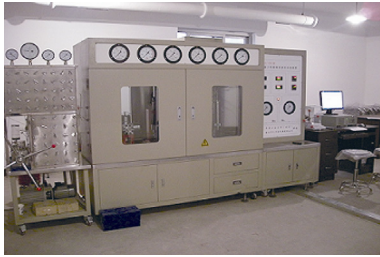
Fig. 1. Constant load creep seepage experiment device.