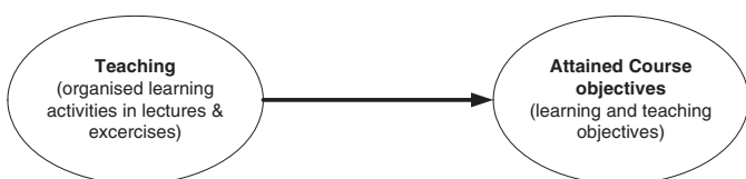
Fig. 1. An Over-simplified Model of the Association between Teaching and Attainment of Course Objectives.

Having had experience with student evaluations at four different departments within three different schools at three different Danish universities, as well as the evaluations across an