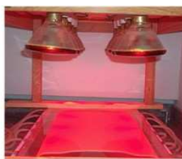
Drying conditions using tape casting