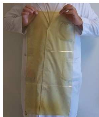
SCALE-UP OF THE PRODUCTION OF SOY PROTEIN FILMS