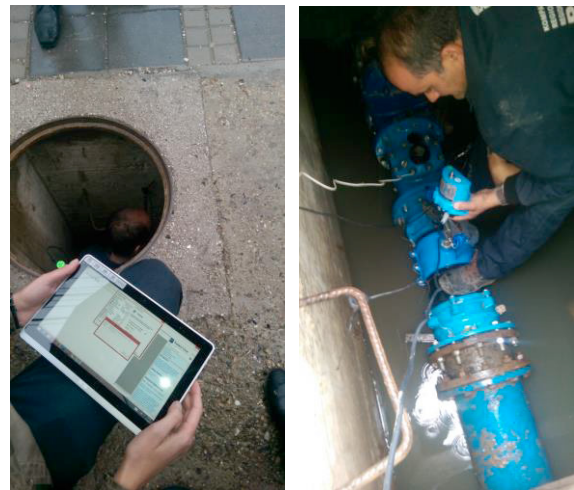
Fig.2 a)Setting up the device Fig. 2,b) installing into main pipes

RWC Prishtina these days has five online monitoring zones, with intention to extend these zones on to 16 more; these days' utility is using online monitoring device with gprs card transmitter as it is shown on the picture below.