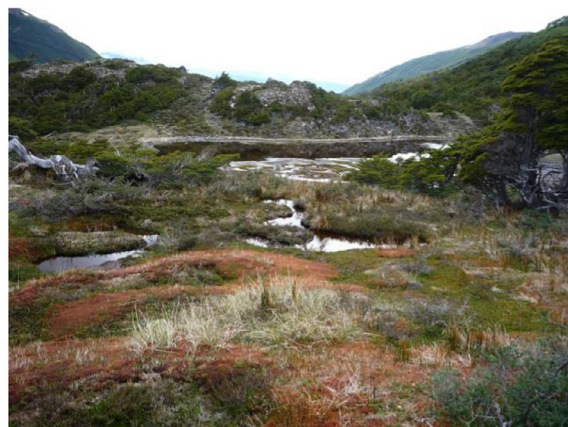
Figure 1 Location Navarino island (in gray), Puerto Williams town and photograph of studied site.