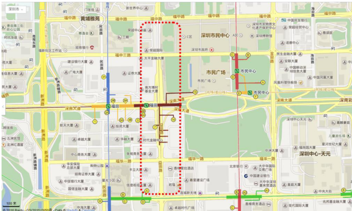
Fig. 1. Location of Futian Railway Station

Futian underground station is one stop on the Guangzhou-Shenzhen-Hongkong railway line. And it is the first underground railway station in the middle of a city in China. Futian underground station stands on the west of the citizen square of Futian district, on the north of Fuzhong Road, on the south of Fuhua Road, and along the Yitian Road.