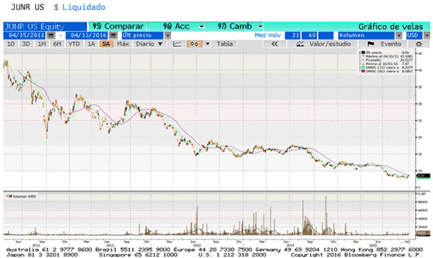
Fig. 1. Evolution of Junior mine prices.