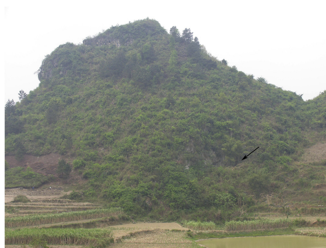
Fig. 2. Landscape of Tintang Cave.

Currently, stable isotope data exists from eight sites in southern China (Jianshi, Longgupo, Longgudong, Juyuangdong, Chui Fengdong, Mohui, Sanhe, upper Pubu Cave) that span the Quaternary (Wang