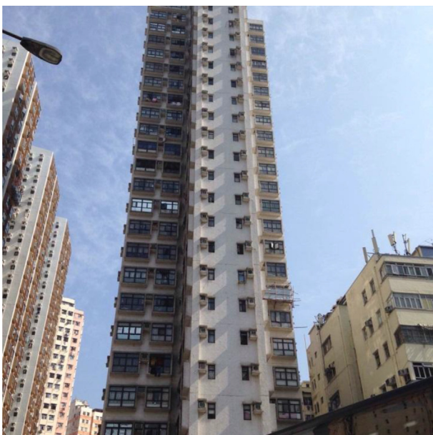
Fig. 1. Typical high-rise residential façades with rhythmic air-conditioners (Photographed by the authors).

In Hong Kong, housing supply comes from two main sources: firstly, private sector developments motivated by commercial incentive; and secondly, the public provision of welfare housing. The public housing sector further has two major sub-categories: public rental housing and subsidized-sale housing (Hong Kong Housing Authority, 2015). The composition of the three major housing systems is shown in Fig. 2. There are about 170 public rental housing estates and over 2 million people live in public rental housing. The occupants of public rental housing flats are low-incomes who rent the units at discounted rates. The public rental housing is managed by the Hong Kong Housing Authority. The Housing Authority also introduced various subsidized-sale public housing schemes to provide an alternative for public rental housing tenants to own a home. The public and private housing systems