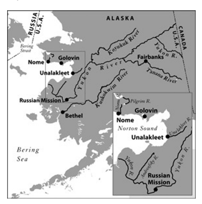
Fig. 1. Study area.

J. Raymond-Yakoubian et al. Marine Policy 78 (2017) 132–142