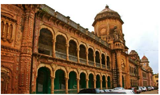
Fig. 1. (a) View of Mubarak Mandi Campus; (b) Front Façade of Army head Quarter

The Aesthetics and Architectural features of Mubarak Mandi is distinct from the cultural heritage of Ladakh and Kashmir region in the state. The complex is personification and epithet of Dogra Art and Architecture, needs to be highlighted at national regional level as it is having high and strong historical Architectural values.