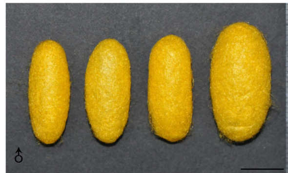
+/+ U6-sgRNAs/+ Nos-Cas9/+ ΔJHE