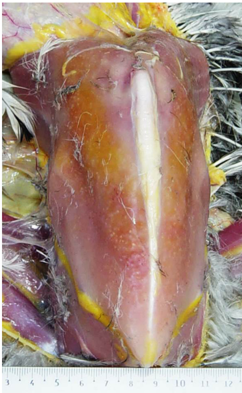
FIGURE 1. Mixed-breed, adult backyard chicken (chicken 3). Note numerous well-demarcated, white, rice-grain sized and shaped areas (lymphoma) on the surface of the pectoral muscle.

When necropsied, moderate pectoral atrophy was noted in chickens 1 and 2, whereas chicken 3 had numerous well-demarcated, white, rice-grain sized and shaped foci distributed both on the surface and within the pectoral muscle (Figs. 1 and 2). The proventriculus was severely transmurally and circumferentially thickened, obliterating the lumen in all the 3 chickens. Moderate roundworm intestinal parasitism due to Ascaridia spp. was identified in chickens 1 and 3.