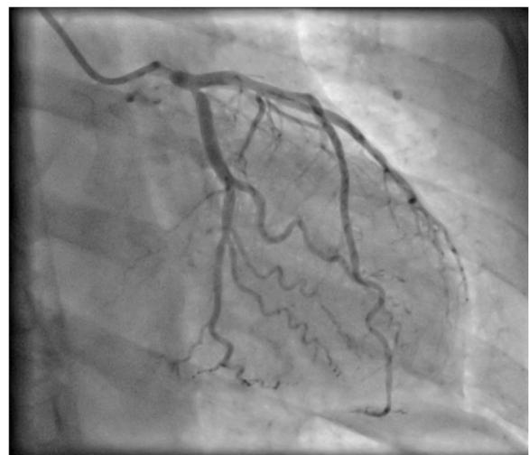
Fig. 1. The coronary angiogram of a patient with chronic stable angina. Her age was 47 years. (Proximal left main stenosis of 80%).