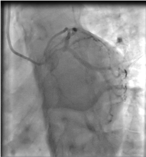
Fig. 2. Another angiographic view of the same patient.