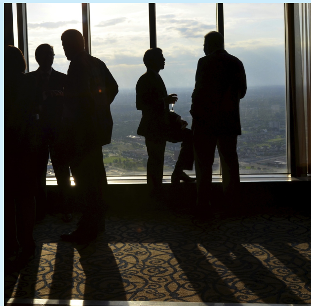
The ASE Foundation Gala, held at Windows on Minnesota , was a joyous event with spectacular views.