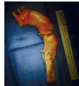
Aortic arch–descending thoracic aorta composite graft with 3 segments made from 4 homografts.

In the operating room, the right subclavian artery (SCA) and right femoral artery were exposed, 8-mm grafts were sewn end-to-side for arterial inflow during cardiopulmonary bypass, and a median sternotomy was performed. The anatomy superior to the heart was unrecognizable from the intense inflammation around the aortic pseudoaneurysm. Bypass was initiated with cooling to 15°C, and the heart was arrested and herniated into the right side of the chest through an opening in the right pericardium. Through this opening and a small left anterior thoracotomy, the DTA