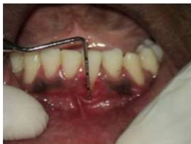
Fig. 1 – Preoperative.

Initial therapy included patient education and motivation for the maintenance of good oral hygiene and thorough scaling and root planing. A complete blood profile was done in which