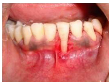
Fig. 3 – Recipient bed.

all parameters were in normal range. The patient was recalled after two weeks for surgery.