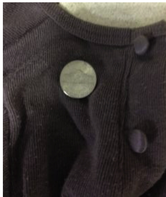
Figure 2. Buttons on patient's shirt; size relative to U.S. nickel coin.

diameter \geq 20 mm, DB size cannot be used to universally predict risk for injury (2). Also, even a spent cell can still maintain considerable residual voltage (2). DBs