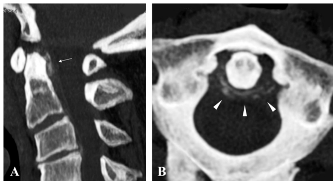
Fig. 2. Cervical computed tomography (CT) scans around the odontoid process. Sagittal reconstruction showing the linear calcification at the posterior side of the dens suggesting calcium pyrophosphate dehydrate (CPPD) (white arrow) (A). The axial image demonstrates the right-dominant, half-ringed form of calcification at the posterolateral side of the dens (white arrowhead) (B).

fever, severe occipital headache, and neck stiffness. At admission, his body temperature was 39.3 °C. He did not show any neurological deficits, including Kernig's sign. Laboratory examination revealed a markedly elevated white blood cell count (12270/ \mu L) and C-reactive protein (CRP) level (23.29 mg/dL). His serum uric acid level (5.2 mg/dL) was not elevated. Blood testing for connective tissue disease or vasculitis, including rheumatoid factor, cytoplasmic anti-neutrophil cytoplasmic antibody (ANCA), perinuclear ANCA, and anti-nuclear and anti-cyclic citrullinated peptide antibodies, were all negative. These findings suggested severe infection such as sepsis and/or meningitis. However, blood cultures were negative, and his serum procalcitonin was not elevated. Routine cerebrospinal fluid studies revealed a slight abnormality (white blood cell 1/ \mu L and protein 47 mg/dL), whereas cerebrospinal fluid culture and anti-herpes simplex virus and varicella-zoster virus antibodies were all negative. Intracranial magnetic resonance imaging (MRI)