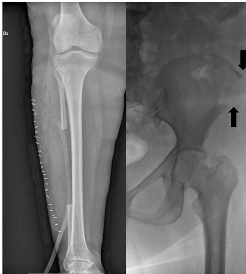
Fig. 2. Autograft bone from peroneal diaphysis (left); cortical bone from iliac crest (right).

approach. Non-union may occur after surgical treatment when a good reduction of the fracture or a stable fixation is not achieved. Systemic environment can be another cause of bone healing failure and non-union, but it is essential to respect biomechanical principles to reduce failure percentage.