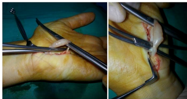
Fig. 2. The intraneural ganglion cyst arising from the superficial branch of the ulnar nerve.

The patient underwent surgery because of the pain increased after conservative management with non-steroid anti-inflammatory drugs and splinting of the wrist had failed. The informed consent that includes benefits and hazards about operation was taken from the patient. A prophylactic single dose of cefazolin was administered 1 h before general anesthesia. The patient was anesthetized in the prone position with general anesthesia, and an above-elbow tourniquet was fastened. A longitudinal around-hypothenar-5-cm incision was made over the mass. After achieving enough exposure, the parent ulnar nerve and its superficial branch was identified (Fig. 2). Our intraoperative impression was that it was an intraneural cyst originating from the superficial branch of the ulnar nerve, and it was entirely filled with mucinous fluid. No articular branch was observed between the mass and any joint of the hand. Excision of the mass was undertaken; the achieved mass was sent to the pathology department to assess its histopathologic features. The histopathology result was congruent with a multicystic ganglion cyst.