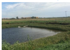
Sheep lagoon wastewater

Wastewater sample + algae and/or bacteria