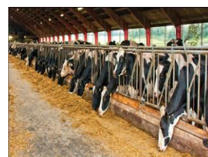
Animal feedlot wastewater

Bioavailable DON (ABDON)/Biodegradable DON (BDON) assays