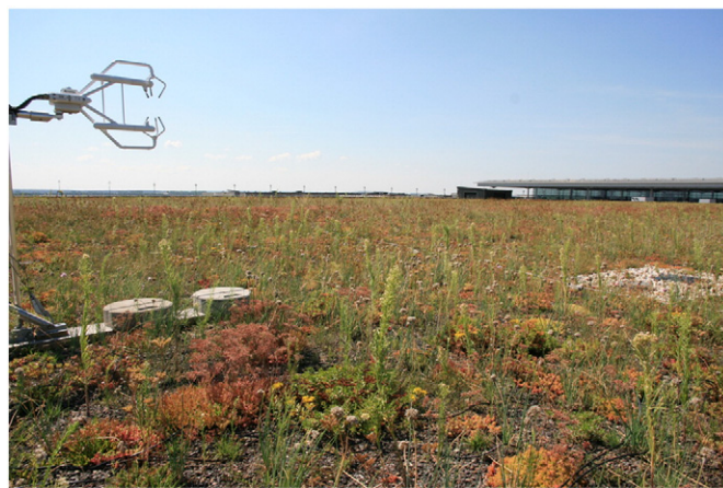
Fig. 1. The BER green roof in the summer period showing parts of the eddy covariance setup (sonic anemometer and open-path gas analyser). The photograph was taken on 22 July 2014.

The vegetation of the non-irrigated extensive green roof is dominated by Sedum species and complemented by herbaceous plants (e.g. Allium schoenoprasum , Trifolium sp., Fig. 1). The vegetation height varies between 0.1 and 0.3 m. Similar to other green roofs our study site is not completely covered by plants (cf. Section 2.2). The substrate has a depth of 0.09 m and is a homogeneous mix composed of expanded shale, pumice and compost (substrate type “M-leicht”, manufactured by Optigrün AG). Substrate laboratory analysis was conducted to determine substrate parameters not specified in the manufacturer datasheet (Table 1). The green roof substrate is followed by a 3 mm protection mat, a 50 mm insulation layer, and a 160 mm layer of ferroconcrete. The roof has a slope of 2%. Gardeners maintain the roof approximately