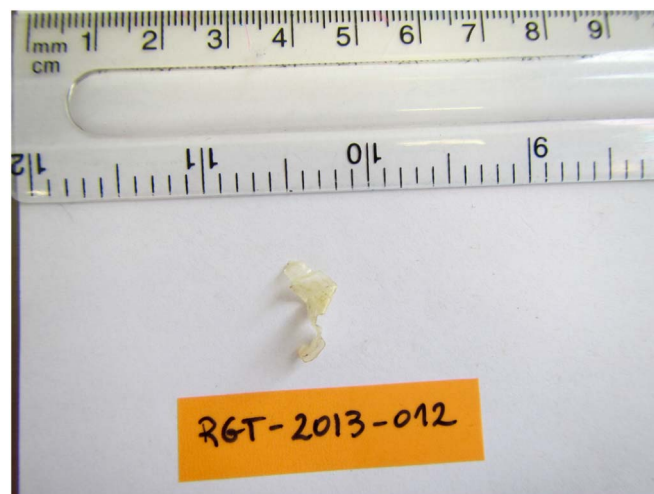
Fig. 1. Sample containing plastic litter (type: sheet) found in regurgitate from a Black-legged Kittiwake chick. Rockabill, Co. Dublin, 2013.

Plastic litter ingestion was higher in Northern Fulmar chicks, with a 28.6% frequency of occurrence (FO), an average mass of 0.0129 g (Range: 0–0.1043 g, SD \pm 0.0317) and an average number of particles of 0.50 (Range: 0–3, SD \pm 0.90); followed by Black-legged Kittiwakes