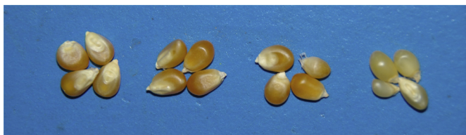
Fig. 1. Photograph of the popcorn kernels from the varieties in this test and showing example of the kernel sizes and color. The samples order from left to right; pc1, pc2, pc3, pc4.

Four 300lb lots of popcorn were purchased from commercial sources in 2015. The popcorn originated from northeast Nebraska, southwest Iowa, central Iowa, and central Indiana. The specific varieties of popcorn were unknown. The popcorn lots were cleaned and packaged in 50lb bags by the vendors. The four lots were labeled in the experiments as pc1, pc2, pc3, and pc4. Their average weights were 18.5 g, 16.0 g, 14.5 g, and 12.5 g, respectively per 100 kernels. Lots pc1, pc2, and pc3 were yellow popcorn while lot pc4 was white popcorn (Fig. 1). The popcorn moisture content was ~13% as received.