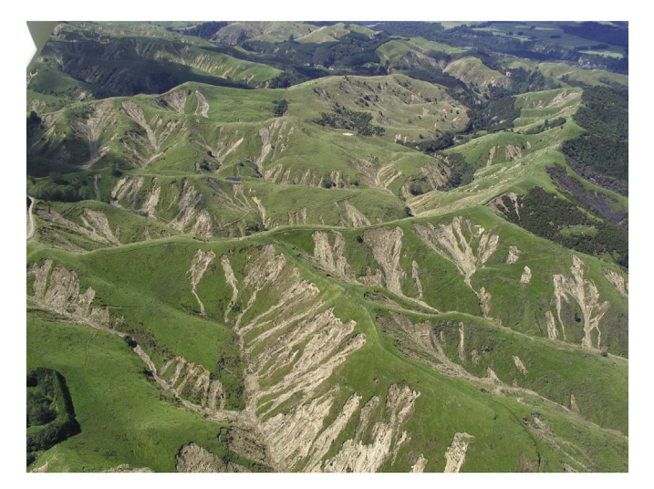
Fig. 2. Landslides resulting from the Wanganui-Manawatu event of February 2004; rainfall exceeded 300 mm in 72 h in the worst affected areas. Landslide locations are aligned to drainage lines and to ridge crests.

and debris and earth slides (terminology: Cruden and Varnes, 1996) involving regolith or weathered bedrock.