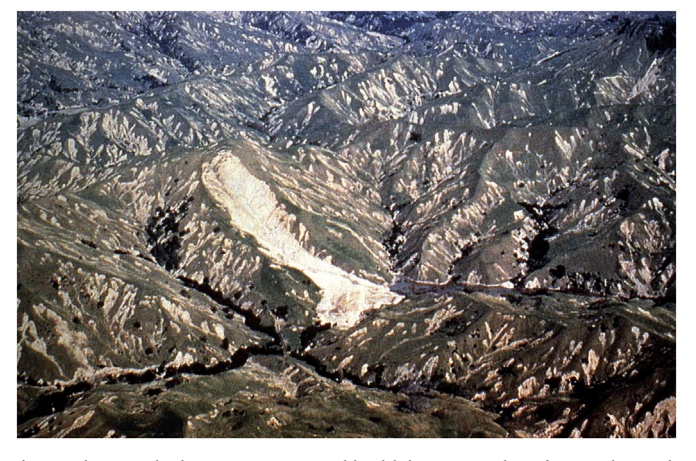
Fig. 1. A large, multiple-occurrence regional landslide event resulting from Cyclone Bola rainfall of 300–900 mm in 72 h, affecting an area of over 8300 km<sup>2</sup>, March 1988, East Coast, North Island, New Zealand.