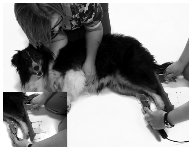
Fig. 2. Dog positioning for the modified dorsal von Frey technique for assessment of sensory threshold in the pelvic limb of dogs. The dog was placed in lateral recumbency and the limb was allowed to rest in a neutral position with a rigid surface placed behind the paw for support. The electronic probe was applied perpendicular to the dorsal surface of the metatarsus, approximately 50% of the distance between tarso-metatarsal and metatarso-phalangeal joints in the cutaneous autonomous zone of the peroneal nerve (inset).