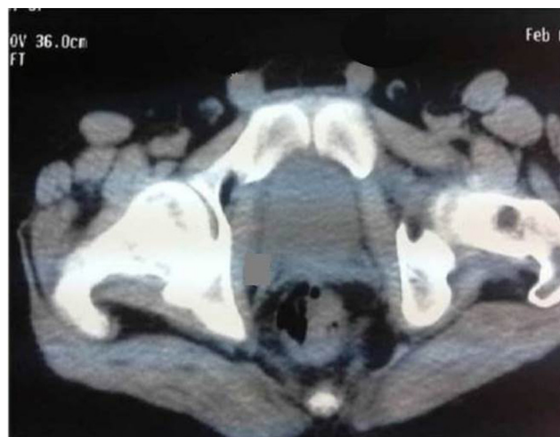
Figure 2. Pelvic CT: axial section through the uterine region and through the two inguinal structures.