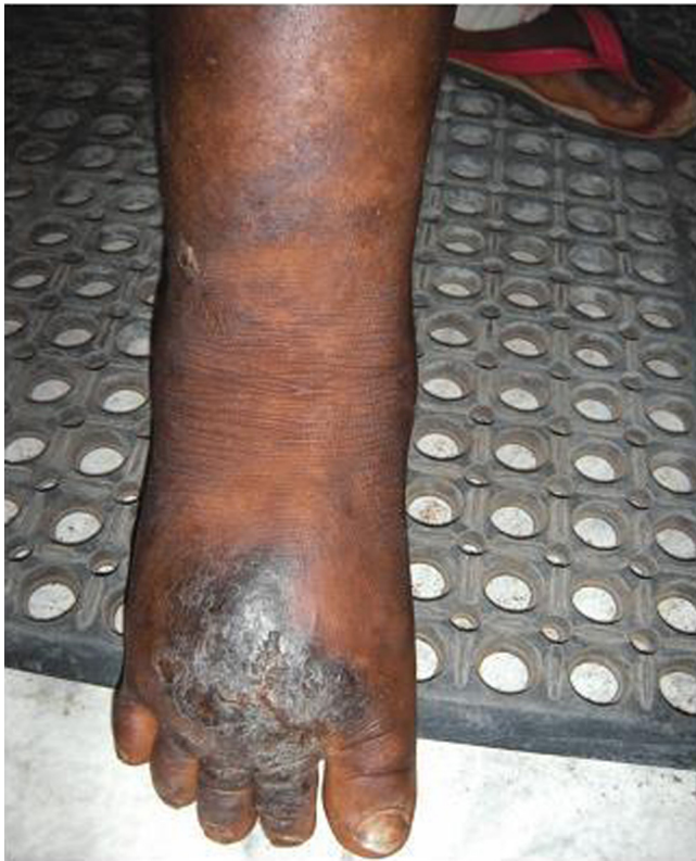
Fig. 1. Lymphedema of Right Lower Extremity.