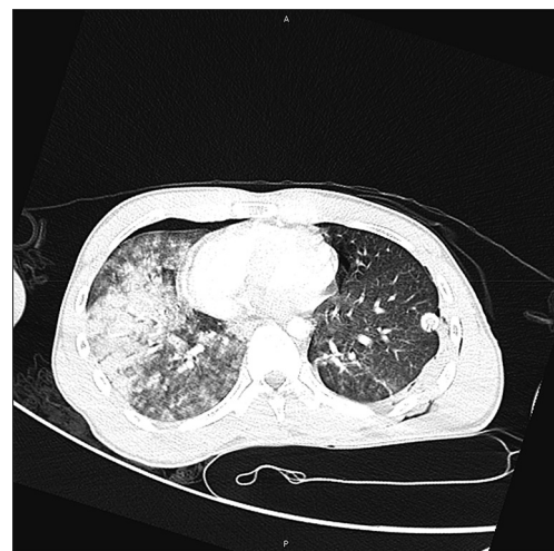
Figure 3 Computed tomography chest scan shows left hemothorax, right pneumothorax, and pulmonary contusion.

Venous backflow and an increasing capillary pressure may cause inadequate tissue perfusion and capillary rupture. The most common clinical manifestations are craniocervical cyanosis, edema, and petechiae; in addition, neurologic symptoms are commonly associated with traumatic asphyxia and determine the patient outcome. 5-7 Brain edema and central nervous system ischemia have been described in various cases. In 1992, Jongewaard et al 8 reported 14 cases of sustained thoracic compression associated with varying degrees of neurologic symptoms, including loss of consciousness, brachial plexopathy, visual