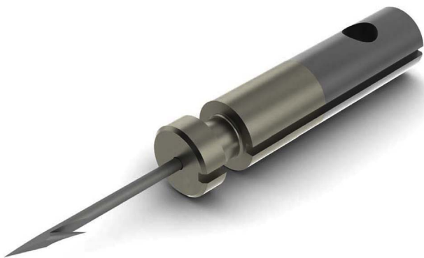
Fig. 3. Single-shot probe as used in X26 models. Dart portion is 13 mm long; other version has 9 mm dart.