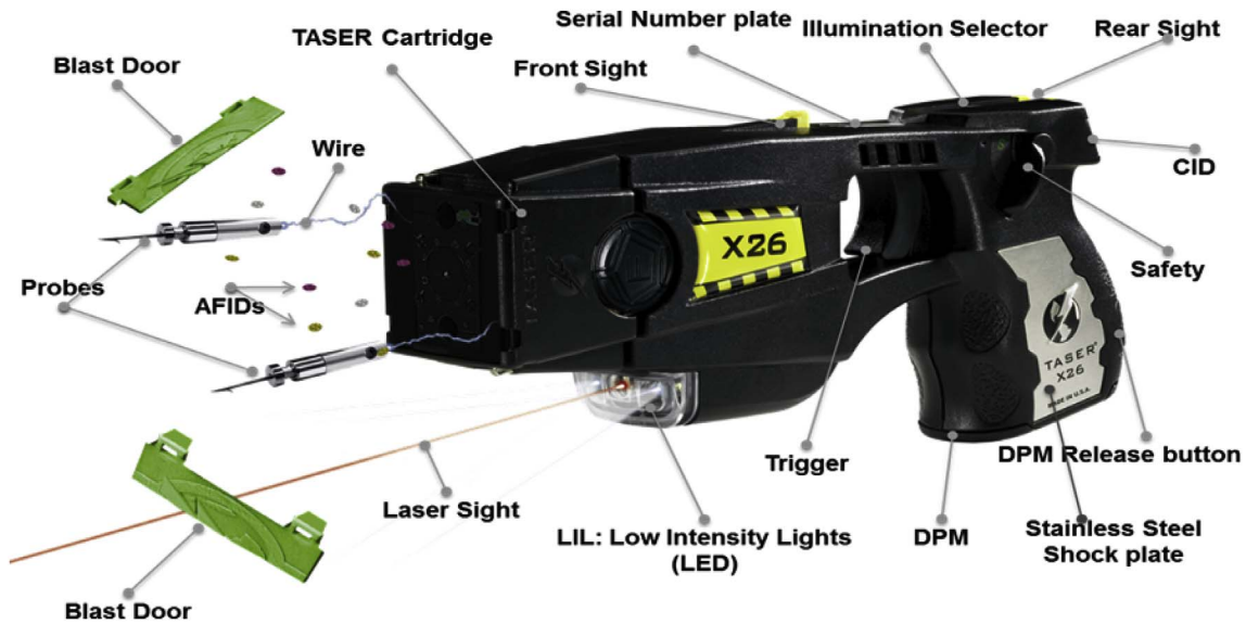
Fig. 1. X26(E) CEW during probe deployment.