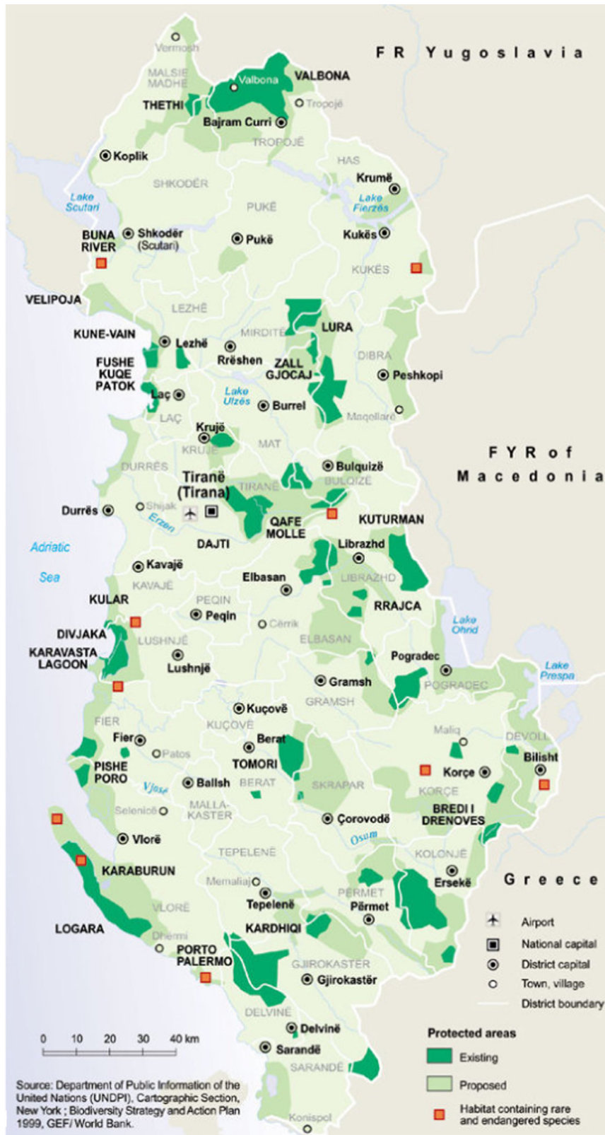
Map 1. Protected areas and conservation hotspots in Albania. http://www.grida.no/graphicslib/detail/protected-areas-and-conservation-hotspots-in-albania_7486 . Source: Rekacewicz, p. 2006.

or landscape which illustrates (a) significant stage(s) in human history' (Albania-UNESCO World Heritage Center, 2013a, 2013b). As a result, Albania's UNESCO sites can be viewed as nurturing cultural ecosystem services of visitors and Albanians.