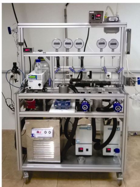
SF-CO 2 Home-made Unit Batch Reactor