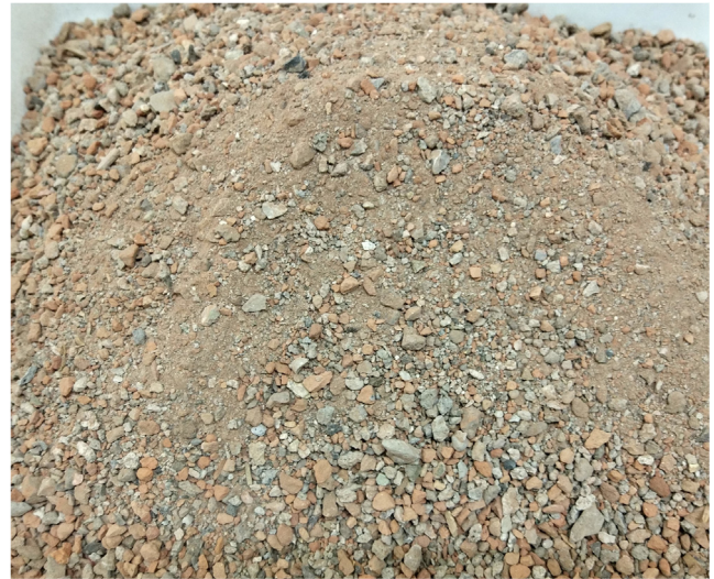
Fig. 1. Recycled fine aggregate from construction and demolition waste.

As shown in Fig. 2, the particle-size distribution of recycled fine aggregate used for this study does not comply with GB/T 25176-2010 [26] and ASTM C33/C33M-13 [27] in that the finer powders are too much in the former. This is, however, advantageous in the case of CLSM as it improves the workability of fresh CLSM [20]. For a better understanding of the micro performances of recycled fine aggregate, X-ray Diffraction (XRD) and Scanning Electron Microscope (SEM) analysis were executed. The dried recycled fine aggregates were sieved, and the XRD analysis was conducted on the powder with the particle size less than 0.075 mm. The samples of 3 g powder were laid down on the glass sheet and gently pressed to form a sample plane of 10 mm × 10 mm. The XRD-7000 X-ray diffractometer (made by the Shimadzu Corporation, Japan) was