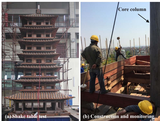
Fig. 1. Study of a multi-story timber pagoda: (a) shake table testing of a scaled model and (b) monitoring during construction process.

Traditional timber structures are low in lateral stiffness. Excessive