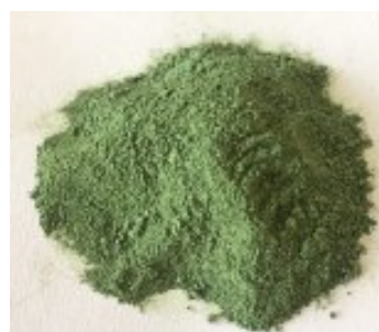
Chlorella sp. PTCC 6010