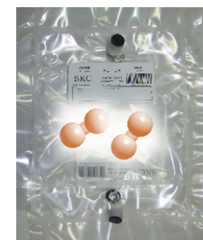
H 2 yield increase