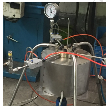
Hydrothermal gasification system

Under optimized operational condition resulted from experimental design based on RSM.