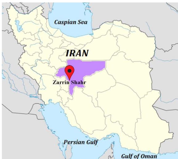
Fig. 2. Map of Iran indicating the city of Zarrin Shahr (Isfahan province is shown in highlight).

biomass, 4.2% from heat energy (non-biomass), 3.8% from hydroelectricity, and 2% electricity from wind, solar, geothermal and biomass energy sources (REN21, 2014).