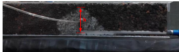
(c) t=4 s